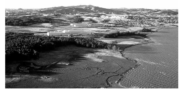
Point Pinole's Whittel Marsh (foreground) is home to the salt marsh song sparrow and salt marsh harvest mouse.